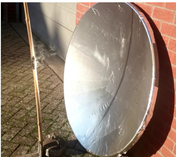
Figure 2: Satellite dish prototype

The second concept, the cheap-as-possible solution, was developed in tandem using readily available materials and tested in Doetinchem, the Netherlands on the 24 th of December, 2018. The test was conducted to find the focal point and test the reflective potential of the prototype. The test setup can be found in Figure 2.